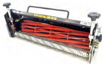
10 bladed cylinder with groomer