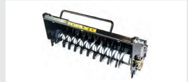
Scarifier with Tungsten tipped blades