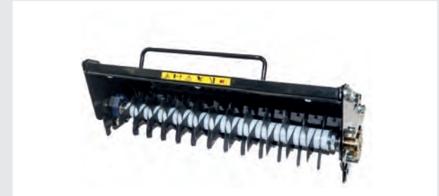
Scarifier with Tungsten tipped blades