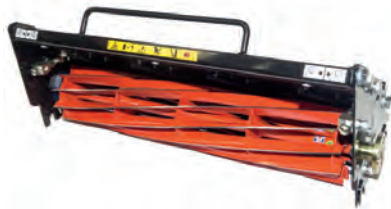
10 bladed cylinder