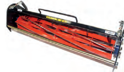
6 bladed cylinder