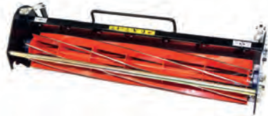
8 bladed cylinder