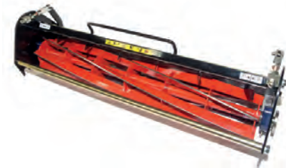
6 bladed cylinder