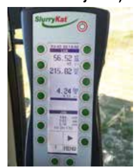
With Load Sensing Hydraulics (in cab touch screen)