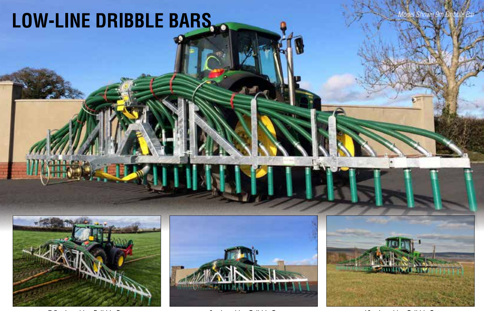
7.5m Low Line Dribble Bar