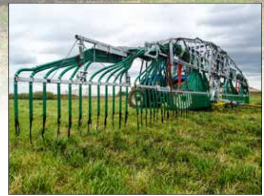
12m Dribble Bar