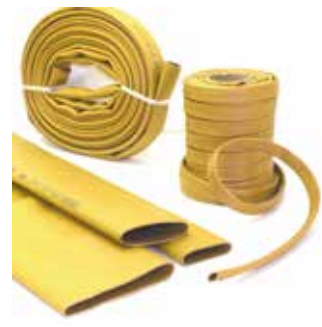
TALK TO A MEMBER OF OUR SALES TEAM TODAY.