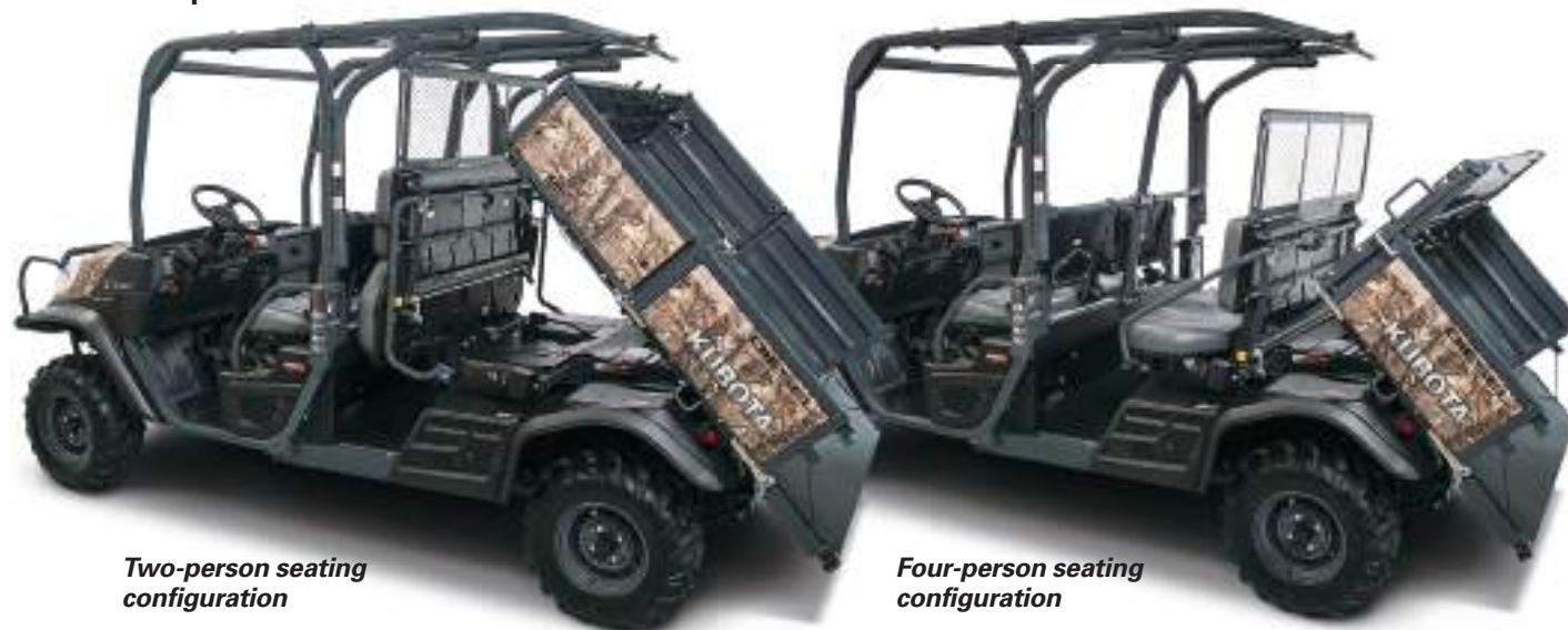
Two-person seating configuration

Move back and secure the protective screen with back rest. Finally, lower and secure the bench seat. Reverse these three steps to restore the RTV-X1140's full-length bed.