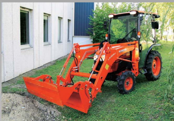
GRAPPLE BUCKET 4-IN-1