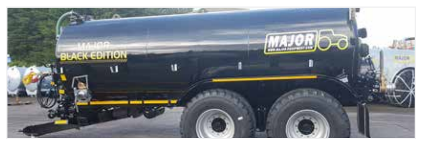
Choice of painted or galvanised finish