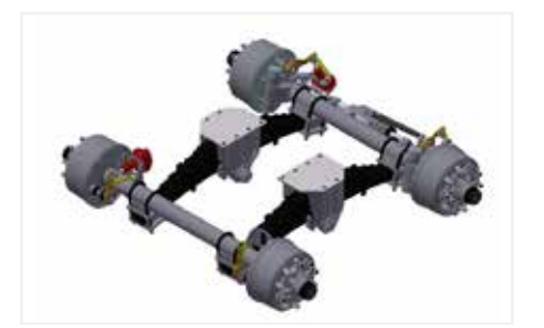
Heavy duty bogey axle, ideal for rough terrain