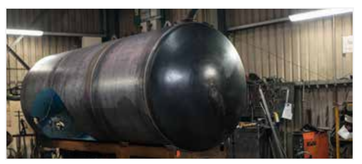
The joints on the tank are welded to ensure a high-quality and visually perfect weld seam.