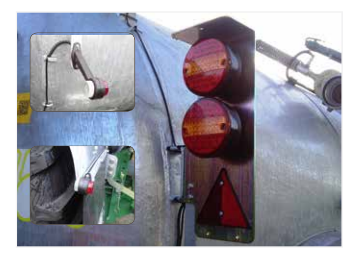
Double LED Lights: Double LED lights and LED side markers can be fitted for increased operator safety