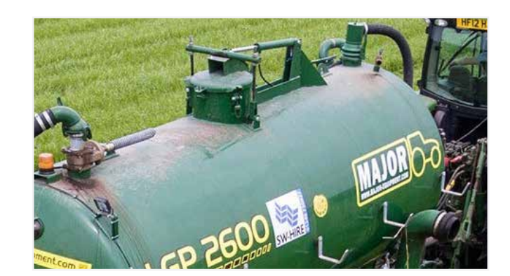
Top Fill: The hydraulically controlled top fill is used to fill the tank from the top. This option allows for high flow rates and fills the tank to its optimal level.

Autofiller: 6" or 8" hydraulic coupler. It is ideal for slurry pits that are difficult to access. It reduces your filling time by half. A galvanised tripod is supplied as standard.