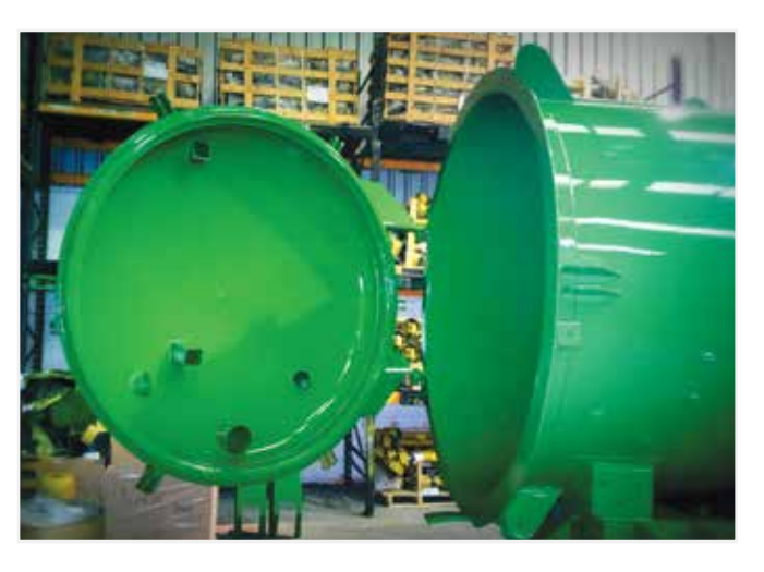
Fully Opening Rear Door: These doors are mounted on hinges. They are locked by six threaded hooks.