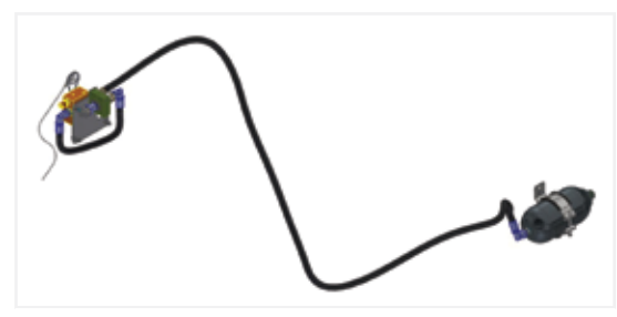
Fitted with safety breakaway cable for safer use on public highways.