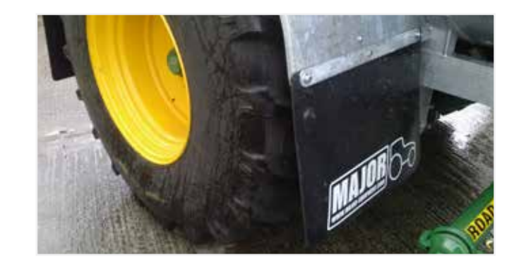
Mud Flaps: 6mm heavy duty rubber mud flaps