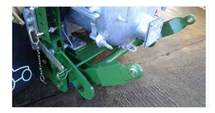
Rear Linkages : Linkages can be added to your tanker to allow slurry injector units to be fitted at a later stage.

www.major-equipment.com www.major-equipment.com