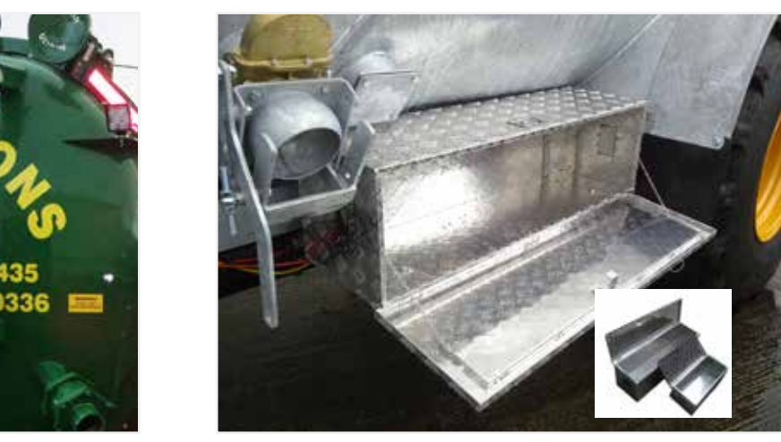
Toolboxes: Two sizes available: 1230 (L) x 370 (W) x 370 (D) 760 (L) x320 (W) x 250 (D)