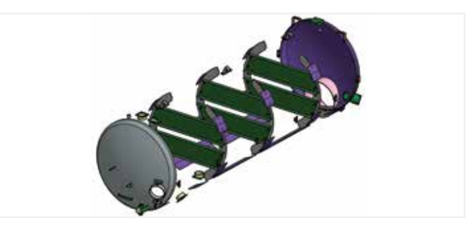
Internal baffle plates improve operator driver safety by preventing wave motions during transport.