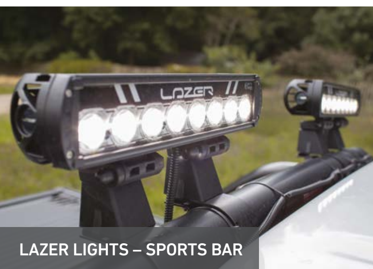
LAZER LIGHTS – SPORTS BAR