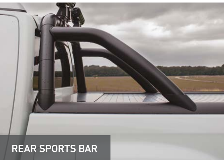
REAR SPORTS BAR