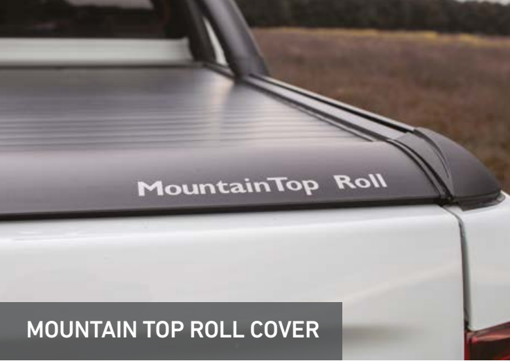
MOUNTAIN TOP ROLL COVER