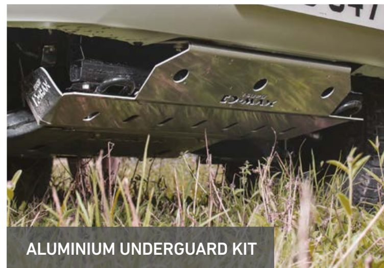
ALUMINIUM UNDERGUARD KIT