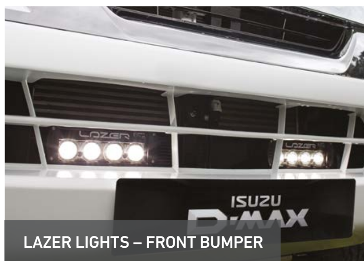
LAZER LIGHTS – FRONT BUMPER