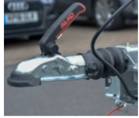
50mm ball coupling head