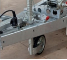
Heavy duty jockey wheel