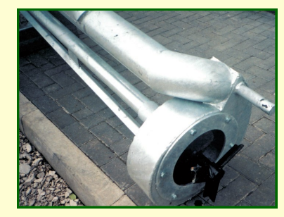
External fins break lumps and force feed the impellor for high outputs.