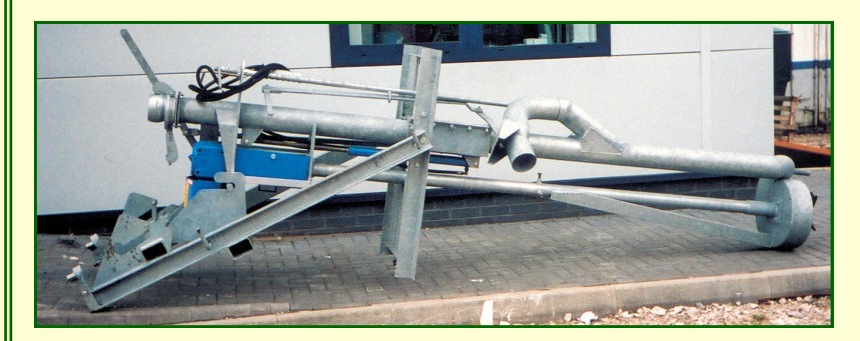
Powerflo variable depth pump, 8-10ft.