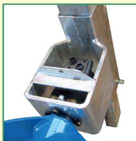
The mixer is offered with three different motor sizes.