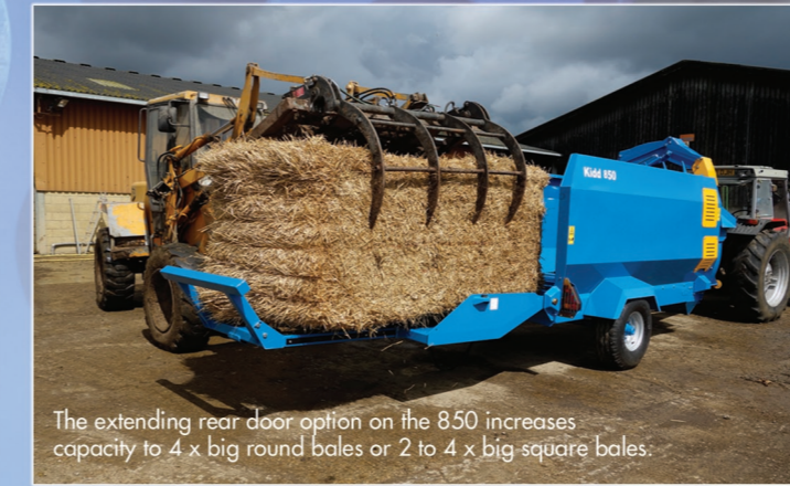
The extending rear door option on the 850 increases capacity to 4 x big round bales or 2 to 4 x big square bales.