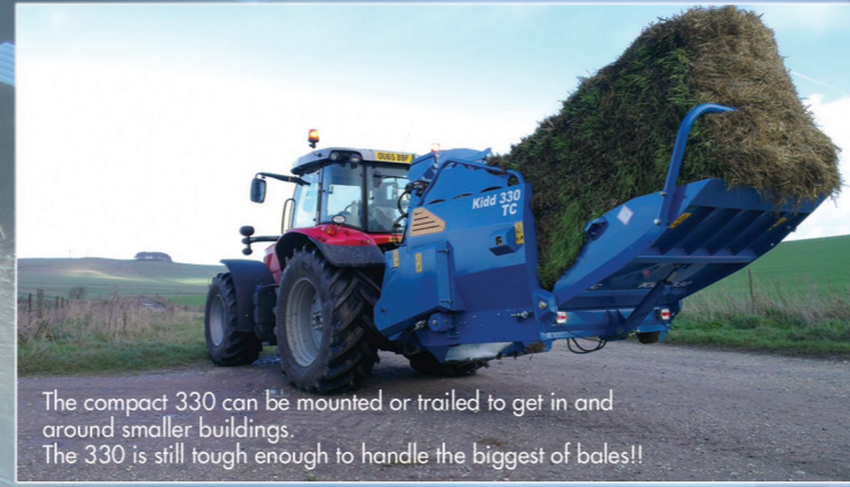
The compact 330 can be mounted or trailed to get in and around smaller buildings. The 330 is still tough enough to handle the biggest of bales!!